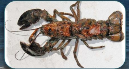
Lobster showing symptoms of shell disease due to plastic (BPA) as per University of Connecticut

The Northeast Chapter of the American Littoral Society and the Village of Asharoken are Sponsoring the Annual Long Island Sound Coastal Cleanup