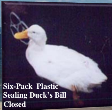
Six-Pack Plastic Sealing Duck's Bill Closed