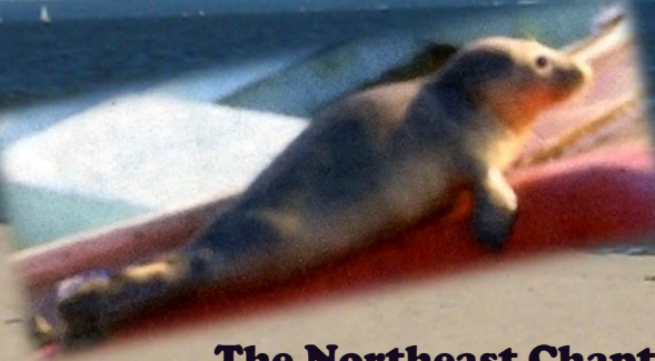
Baby Seal, Northport Harbor 3 Days After Coastal Cleanup Northport Observer Photo 10-5-10